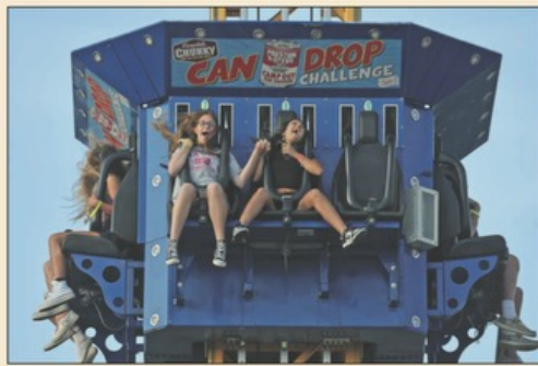
Youngsters of all ages took the "Can Drop Challenge" at this year's Fireman's Fair, held nightly in Mallard Park in Manasquan through Saturday.