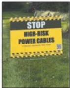
Stop High-Risk Power Cables is a group of citizens concerned with Atlantic Shores' plan to run energy cables through residential areas of Sea Girt, Manasquan and Wall.

ATLANTIC SHORES SCOPE OF WORK On July 2, according to a press release from the U.S. Department of the Inter-