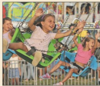
The swings are one of many popular rides at the Fireman's Fair each year. Manasquan Volunteer Engine Company No. 2 has been running the fair annually since 1996.

The Fireman's Fair, hosted by Manasquan's Volunteer Engine Company No. 2, will be running daily until Saturday, Aug. 3 from 6 to 11 p.m. Each year, volunteers from both of Manasquan's fire departments, the Manasquan Police Department, the Ladies Auxiliary,